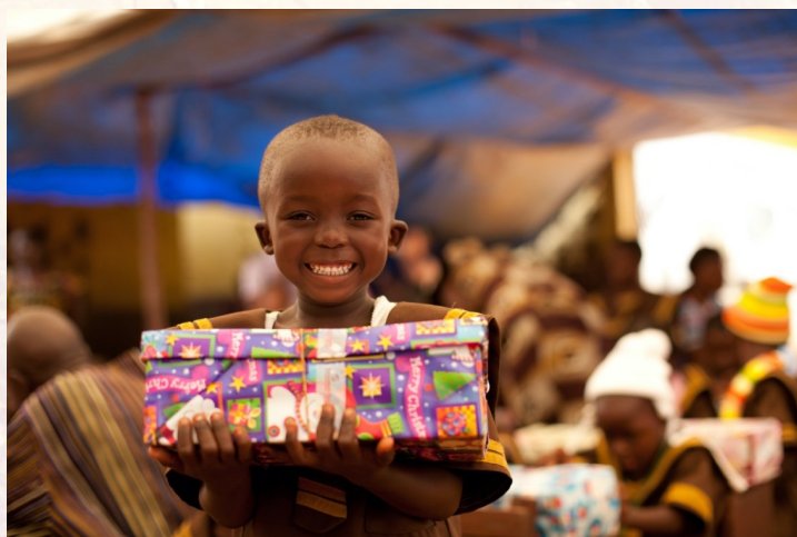
A delighted child in Liberia